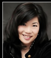
DIRECTED BY NATSU ONODA POWER